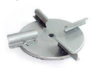
Stainless Steel Disc